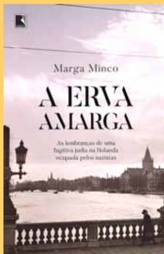
Marga Minco Bitter Herbs