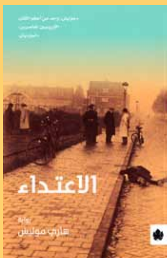
Harry Mulisch The Assault