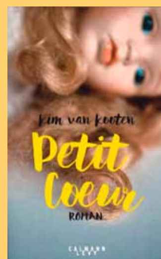
Kim van Kooten Darling