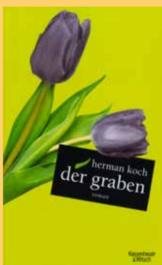
Herman Koch The Ditch